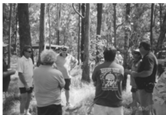
The JM team in conference