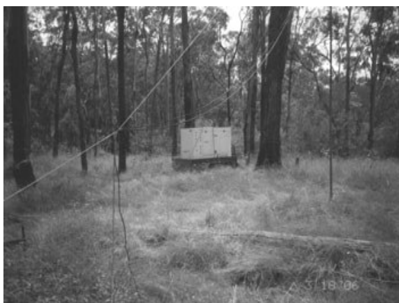
20kVA diesel generator