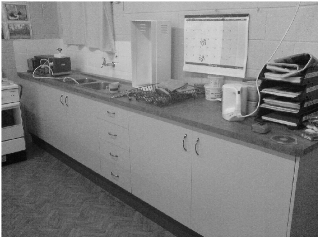
A view of our beautiful new kitchen prior to installation of the “Zippy” HW heater (seen near the sink) – see page 3