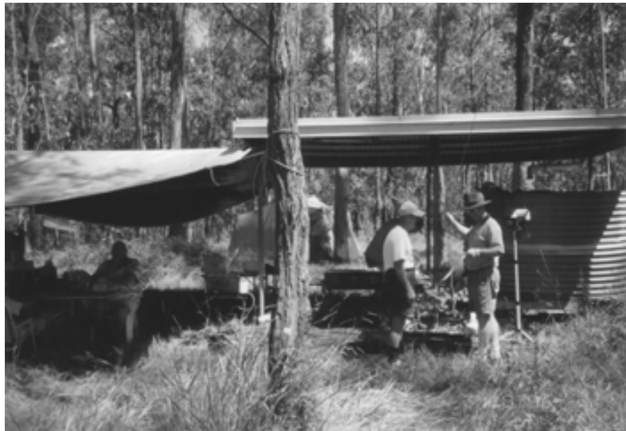
Last Year's John Moyle Field Day